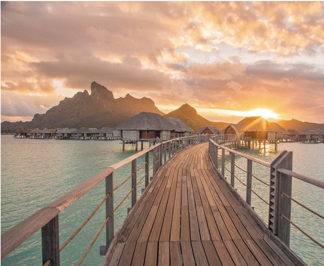
52 Overwater bungalows in Bora Bora, French Polynesia, northwest of Tahiti.

51 Venus rising over the mountains before sunrise in the Elqui Valley in Chile.